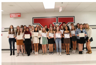
National Social Science Honor Society