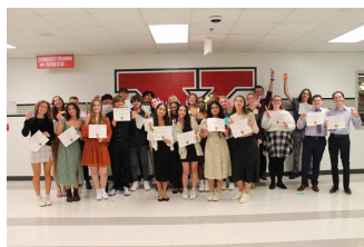
National Science Honor Society