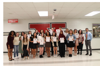
National Spanish Honor Society