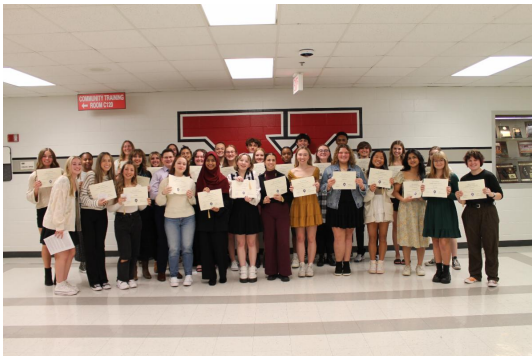
English Honor Society